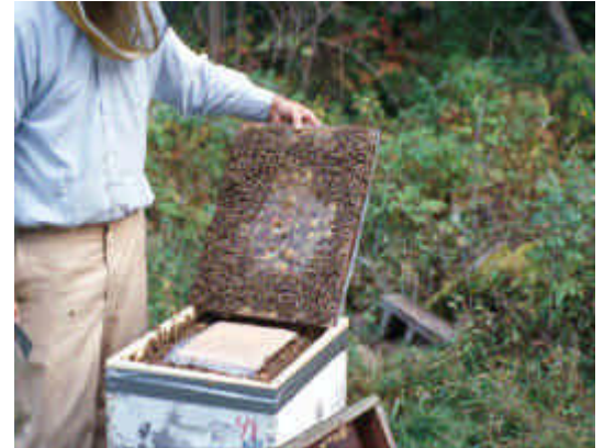
Fig. 12: A formic acid pad similar to the Mite-Away II™ pad.