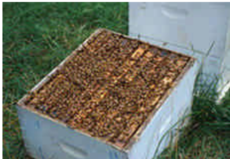
Fig. 7: A strong population of workers ready for winter.

Remember! For an estimate of pest density to be meaningful, each step in the sampling method must be standardized. This means monitoring mite levels at the same time each year, and monitoring all colonies exactly the same way. For the ether roll, this means collecting samples from the same place in each colony (2 or 3 brood nest combs), collecting the same number or volume of bees in each sample, applying the same amount of starting fluid, and shaking the jar in the same manner. For the sticky-board, the same size board must be used each time, the sample must be collected at the same time each year, and the board must be left in place for the same length of time.