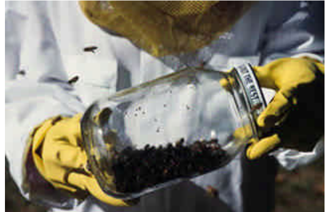
Fig. 6: Mites adhering to the sides of a jar in the ether-roll test.

Remember! For an estimate of pest density to be meaningful, each step in the sampling method must be standardized. This means monitoring mite levels at the same time each year, and monitoring all colonies exactly the same way. For the ether roll, this means collecting samples from the same place in each colony (2 or 3 brood nest combs), collecting the same number or volume of bees in each sample, applying the same amount of starting fluid, and shaking the jar in the same manner. For the sticky-board, the same size board must be used each time, the sample must be collected at the same time each year, and the board must be left in place for the same length of time.