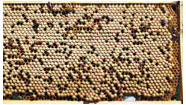
Fig. 10: Comb of capped drone brood being removed from colony.