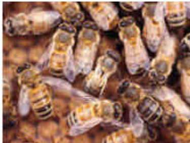
Fig. 2: A worker honey bee with deformed wings.