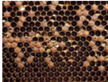
Fig. 3: Deteriorating brood typical with high levels of V. destructor .