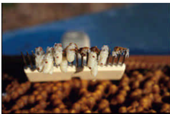
Fig. 4: The 'cappings scratcher' method for surveying for mites.

Beekeepers also play a major role in the transmission of mites. Moving brood among colonies for the purpose of strengthening or equalizing colonies is a common practice that transmits mites. In addition, beekeepers often purchase colonies of bees in the spring to replace winter losses or to increase colony numbers. Some beekeepers purchase small nucleus colonies, usually called 'nucs', from local or regional suppliers. These colonies consist of 1-5 combs of bees and brood and usually come with a queen. Others purchase package-bees (2, 3 or 5 pounds of bees, usually with a queen) from a southern location. An estimated one million packages are shipped throughout the country each year. Each of these practices spread mites, including various types of pesticide resistant mites.