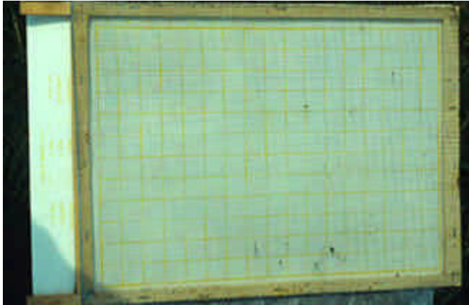
Fig. 5: The 'sticky board' used for surveying for mites.

where R is the mite-to-bee ratio in the sample and #B is the number of bees in the sample. The conversion factor (1.783) is from Calderone and Turcotte (1998).