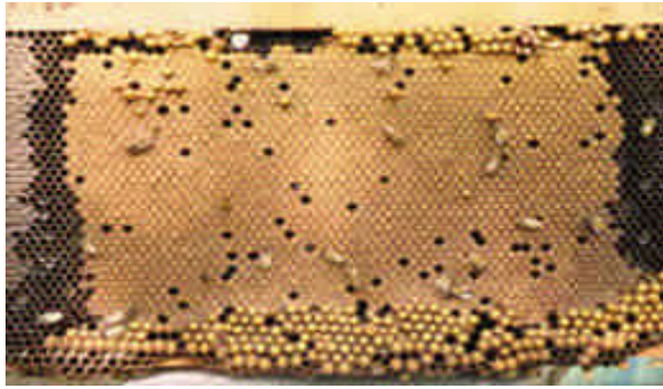
Fig. 9: A worker comb with excess drone cells. Such a comb is best culled and replaced with a comb of 95-100% worker cells.

The drone brood removal method has no known deleterious effects on colonies, and honey production may be marginally increased.