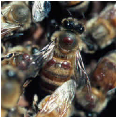
Fig. 1: A mature adult female V. destructor

The parasitic honey bee mite V. destructor [Fig. 1] is considered to be the most serious global threat to beekeeping and to the sustainable production of crops that rely on A. mellifera for pollination. V. destructor , which kills honey bee colonies of European descent within 1-2 years, has killed millions of managed and wild colonies in the US in the past two decades. Apistan® and CheckMite+® have provided some relief, but control has always been unpredictable due to the fact that mite populations often rise rapidly during the honey producing season when treatment is proscribed by label restrictions. Consequently, colonies often suffer serious damage while the beekeeper waits for a legal treatment window to open. The threat from V. destructor has become a matter of grave concern as resistance to both Apistan® and CheckMite+® has become widespread.