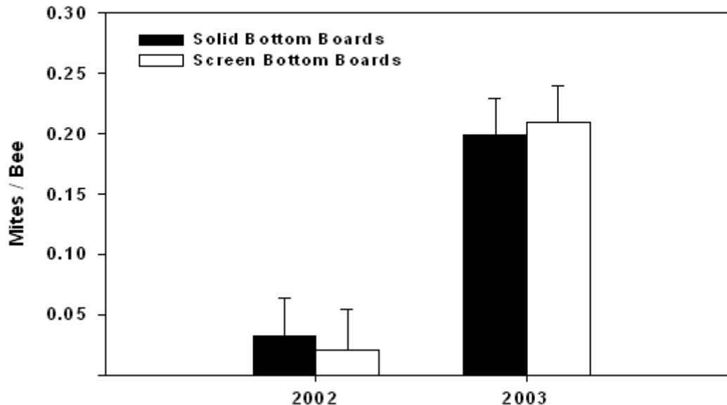
Fig. 11: September mite-to-bee ratios in colonies with and without screen bottom boards during the spring and summer. No significant differences were found.